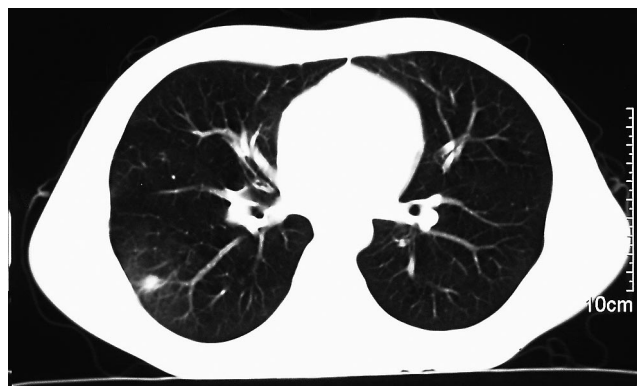
FIG. 1. Patient's CT scan on day 33 after chemotherapy.

The patient relapsed 6 months later, and chemotherapy was begun again. There was no evidence of invasive fungal infection.