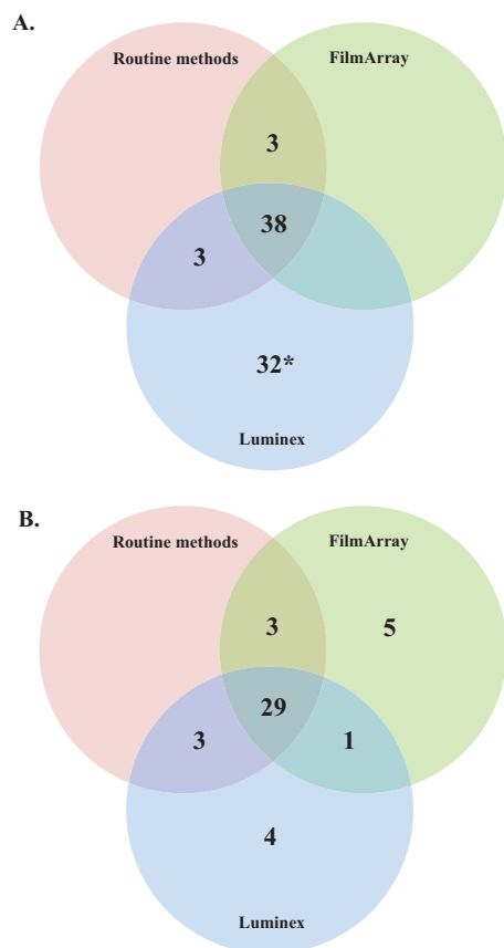
FIG 2 Distribution of positive samples by routine methods, FilmArray and Luminex, for norovirus (A) and Clostridium difficile (B) in characterized stool specimens. *, 31/32 samples were negative upon repeat testing with a new reagent lot.