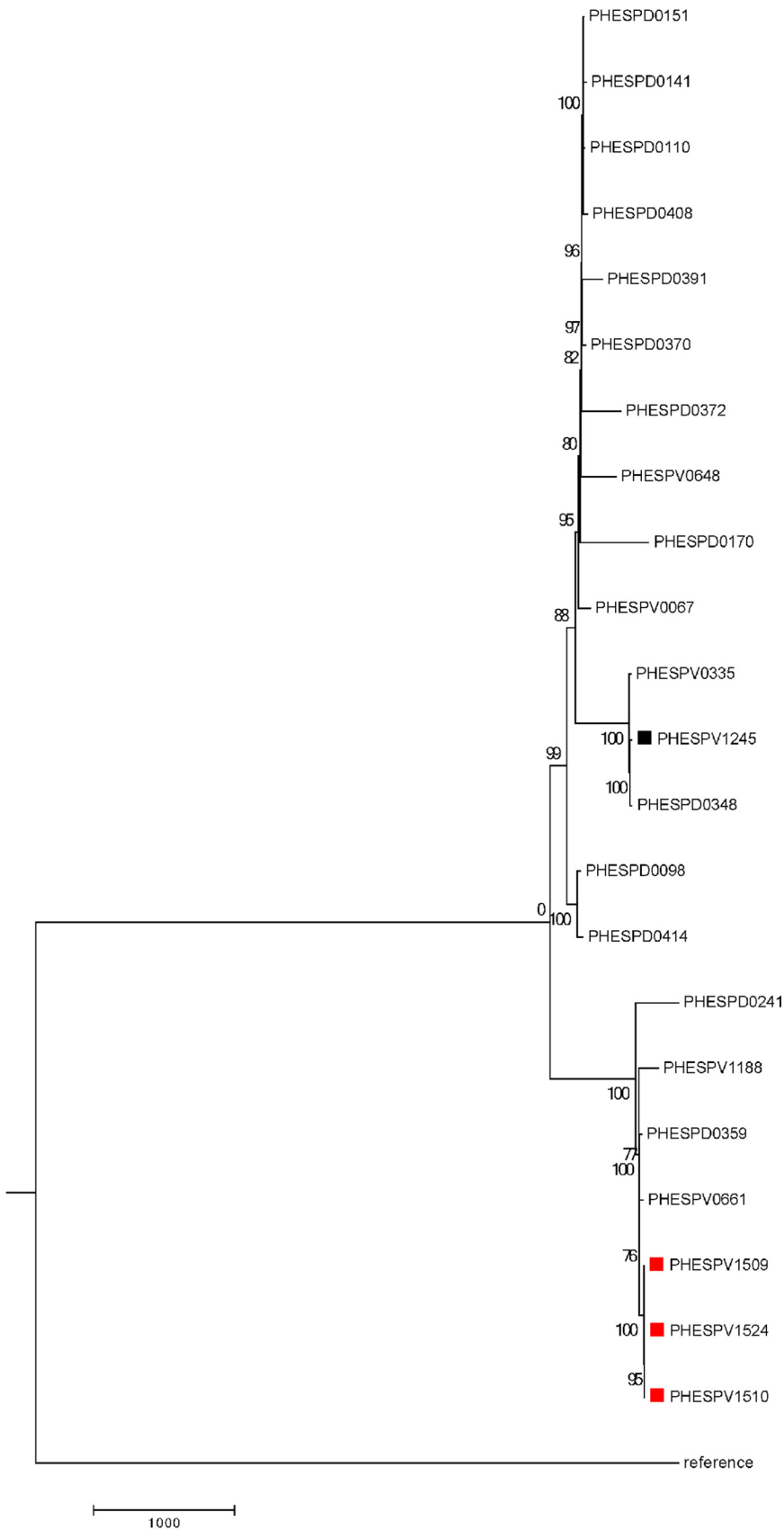
FIG 2 Neighbor-joining phylogeny tree of UK ST156 serotype 9V strains showing outbreak strains. SNP-based phylogeny tree of ST156 serotype 9V strains showing three outbreak strains and 19 contem- (Continued on next page)