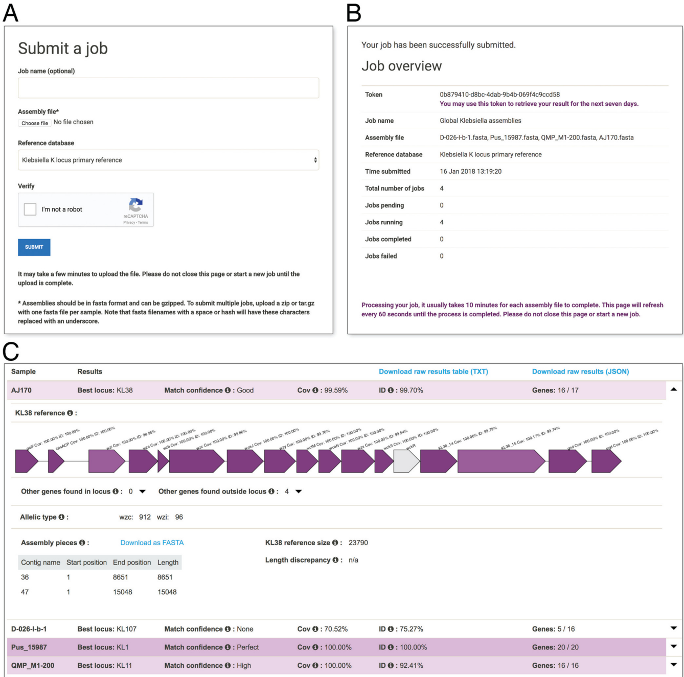
FIG 1 Kaptive Web screenshots. (A) Users choose a file or zipped directory on their local computer and select the desired reference database. (B) Job information screen detailing the number of assemblies uploaded and their status. (C) Kaptive Web results for four Klebsiella isolates, with the first result expanded.

causes assembly fragmentation (56). However, truncated/missing genes and assembly fragmentation can also result from poor read coverage or indel sequencing errors, in which case, the gene is likely still functional. This is why Kaptive is somewhat tolerant of truncated/missing genes and discontinuity—a locus with these issues can still achieve a confidence of “high.” Extra genes in a locus (genes that are not in the best-matching locus reference but are in another locus reference) are strongly indicative of a biological change and thus reduce confidence more so than missing genes—a locus found with an extra gene can achieve a confidence of no greater than “good.” When a locus has genuinely different gene content relative to the reference, the resulting serotype may be affected, but the Kaptive match can still be useful for phylogenetic typing purposes.